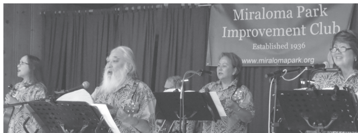
Kapalakiko Hawaiian Band, Election Night