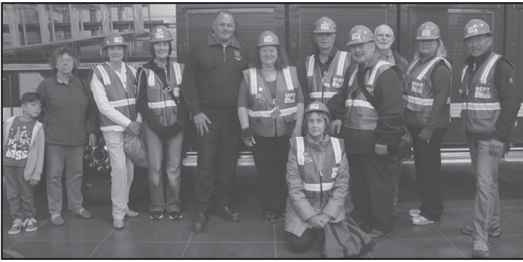
Miraloma Park NERTs at Battalion 9

for the NERT Teams are stored. These boxes contain the supplies needed for a NERT Team to set up a staging area and start assessing damage in the neighborhood. Miraloma Park's staging area is the tennis courts on Sequoia Way. The Battalion Chief reminded the NERTs that they are important in gathering damage information and being on the ground to help neighbors. Thanks to those who attended; we missed those who could not make it.