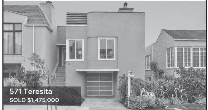
571 Teresita SOLD $1,475,000