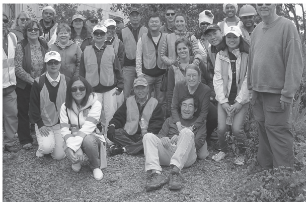
The Community Clean Team for Los Palmos Garden

Please stop by and visit the garden, on Los Palmos at Foerster, take a walk on the wild side.