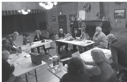
Joint NERT training with Miraloma Park, Sunnyside and Glen Park NERTs