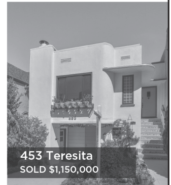
453 Teresita SOLD $1,150,000

I have successfully represented many buyers and sellers in this coveted neighborhood of ours. Please feel free to contact me anytime for any of your real estate needs.