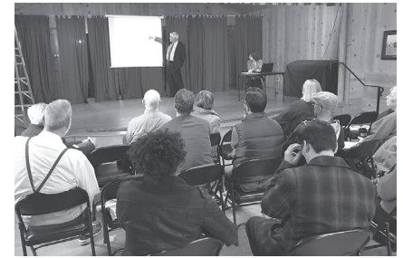
SFPUC Presentation on Blended Drinking Water at June 2017 MPIC Meeting