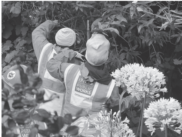
Thanks to Everyone that Helped Transform the Magical Oasis