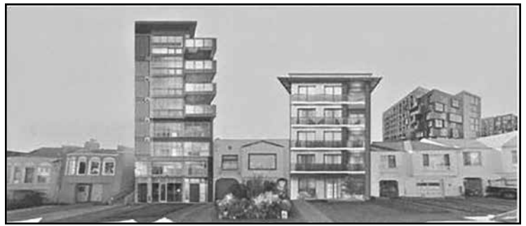
What Single Family Neighborhoods Could Look Like Under SB827