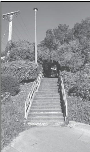
Avoca Alley Staircase looking from Bella Vista Way up to Myra Way

Avoca Alley is the unlit, extended staircase between Bella Vista Way and Myra Way adjacent to the Miraloma Elementary School near a Muni #36 stop. The alley is a short cut to avoid walking an extra block to get from Bella Vista to Myra or vice/versa.