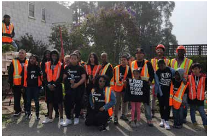
Public Works staff and volunteers from United Playaz