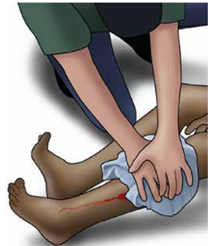
Head Tilt Chin Lift (left) Pressure Stop Bleeding (right)