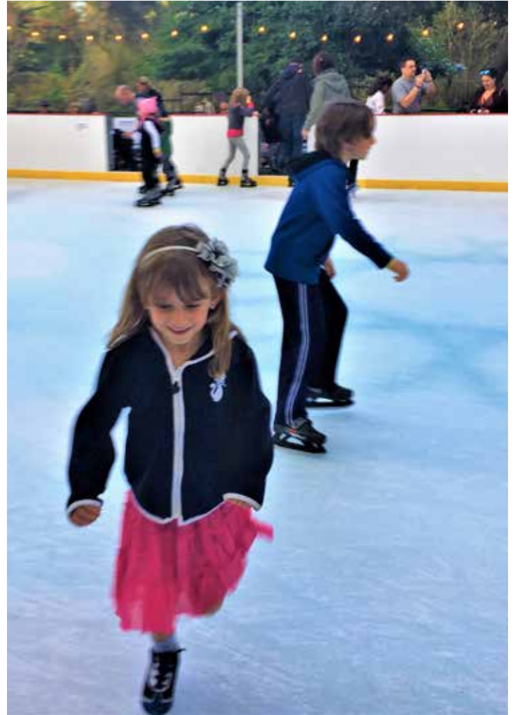
Ice skating in the Park