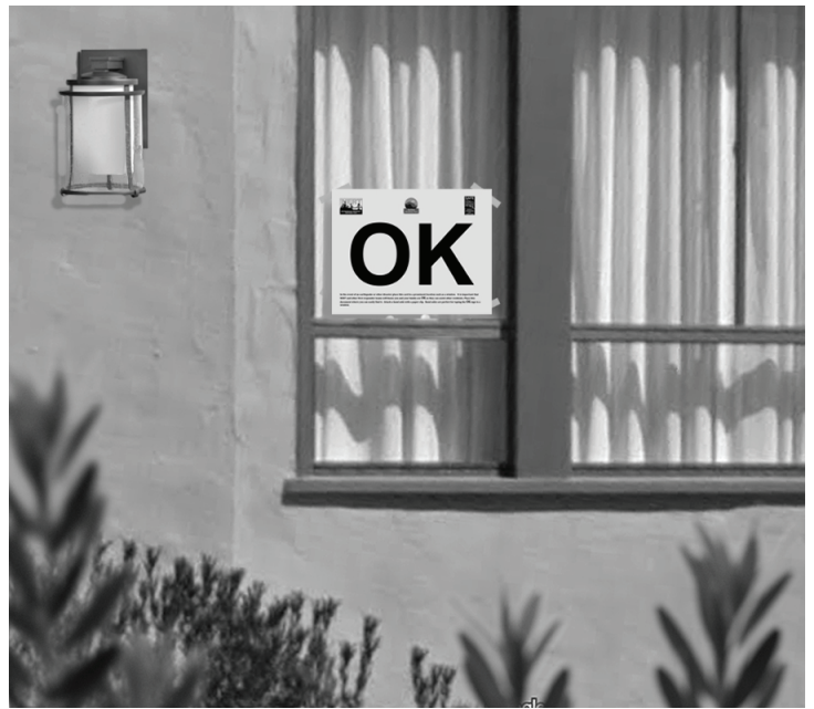
Participation in the OK Sign exercise in April and October

The Block Champion Program will be completing its training in May. Block Champions will each receive a bin of emergency supplies and will start working with their neighbors to help prepare for a disaster. In May, Miraloma Park NERTs will host a joint training meeting with Block Champions to learn how to create pressure bandages to prevent bleeding out fatalities. Loss of blood fatalities are preventable if you are trained and have the needed supplies. Participatory Budget grant funds will allow MPIC to purchase these Stop the Bleed bandages, which will be stored in our Earthquake Supply Storage Container. Block Champions will receive Stop the Bleed bandages with their emergency supplies.