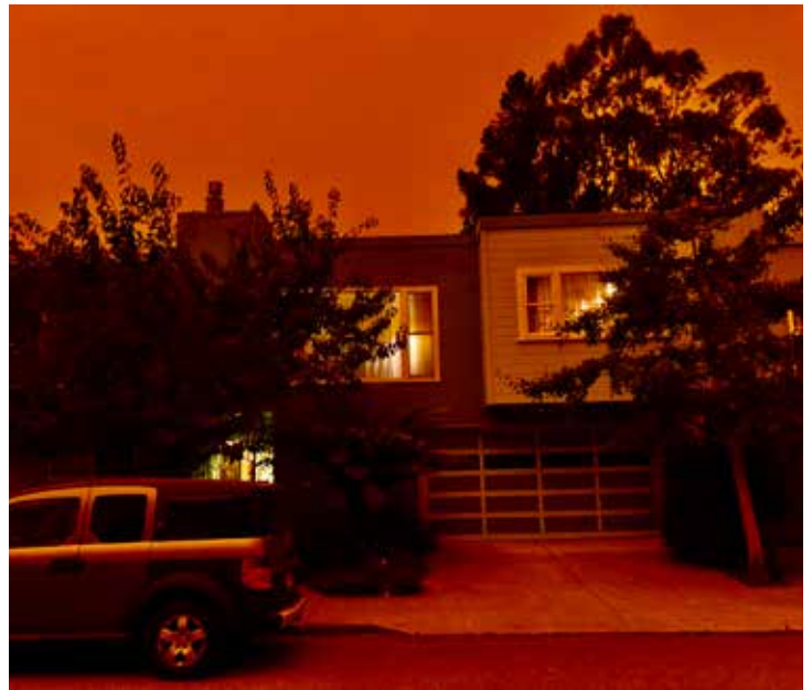
The Miraloma Park smoke-filled skies at Noon on September 9