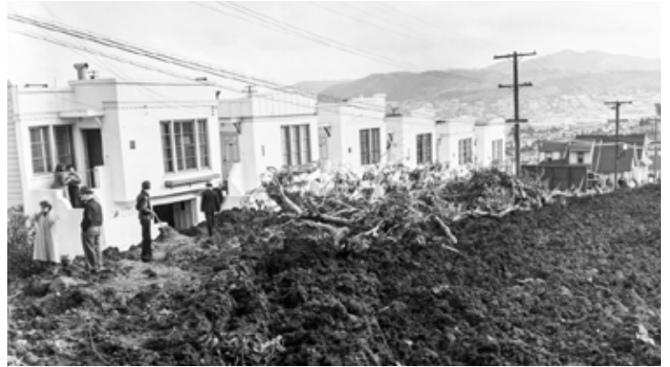
1903 Future Site of Miraloma Park (top)