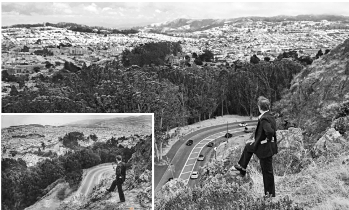
Historical image of O'Shaughnessy Overlook (inset) vs. Tyler Sterkel's 2020 version