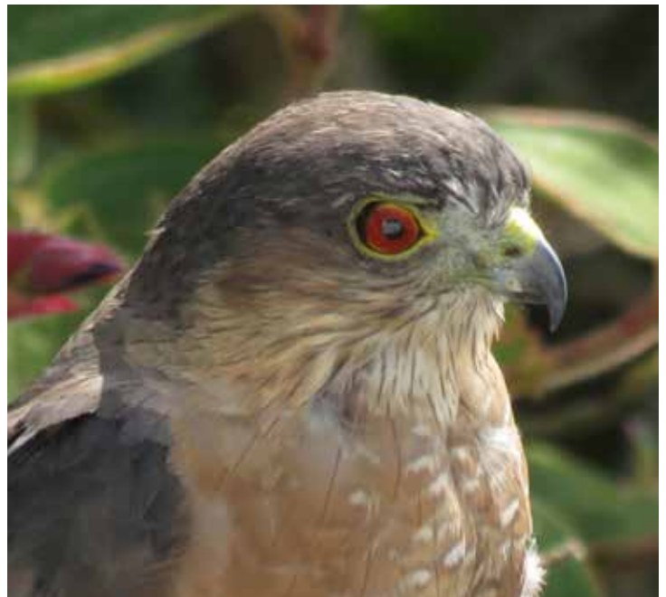
Coopers Hawk

We, as California residents, are obligated to conserve these wildlife populations for future generations of Californians.