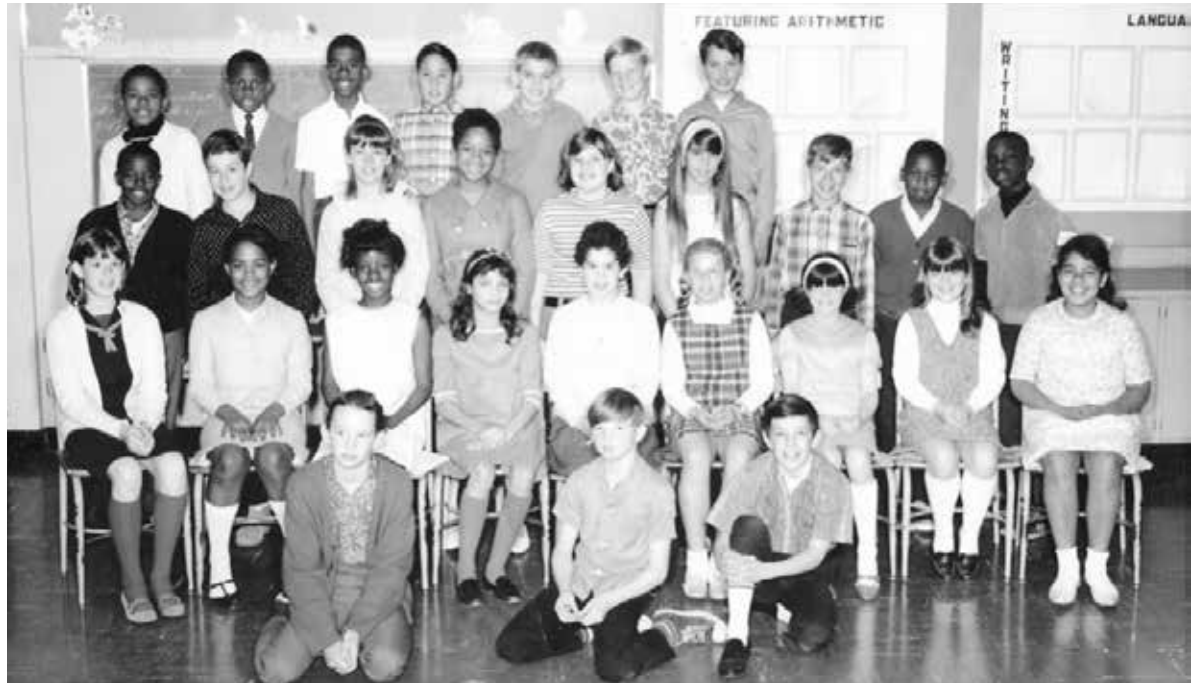
Miraloma Elementary School, 6th Grade - 1967