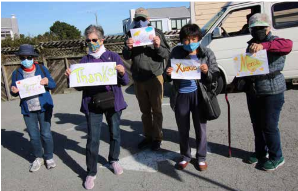
Miraloma Park Community Connectors Walking Group saying thank you to everyone at CLC