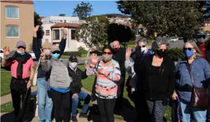
Miraloma Walkers on a typical Thursday outing