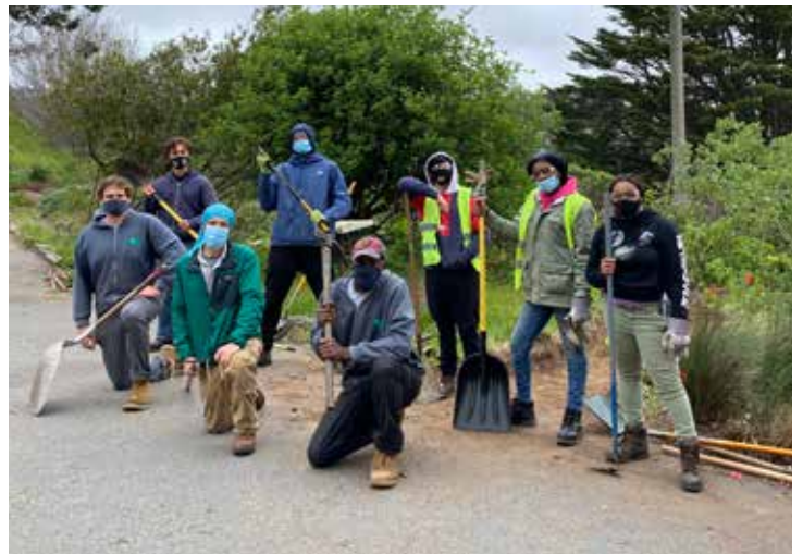
San Francisco Conservation Corps at the MPIC Native Plant Garden

Bella Vista Way (5); Chaves Avenue (3); Del Vale Avenue; El Sereno Court (2); Encline Court (3); Foerster Street (2); Fowler Avenue; Gaviota Way; Juanita Way (2); Los Palmos Drive; Marietta Drive (3); Melrose Avenue; Molimo Drive; Myra Way; Rockdale Drive (2); Stanford Heights Avenue (2); Stillings Avenue; Teresita Blvd (5)