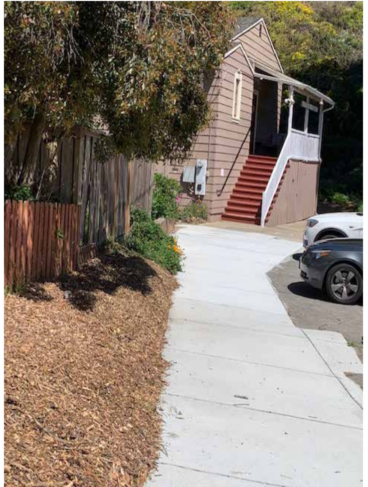
The May Second Saturday crew cleaned the landscaped area along the path and put down new mulch. (above)

The tasks focus on cleaning the grounds (e.g., raking leaves, pruning bushes, sweeping up pine needles, removing weeds, etc.) and keeping the Clubhouse in order (e.g., sweeping the Clubhouse steps, etc.) Volunteers should wear a mask; COVID-19 precautions are followed while working.