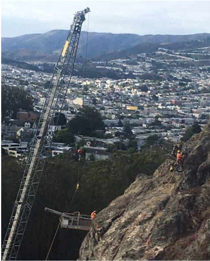
O'Shaughnessy Blvd Central Slope Restoration Project

I was curious about the work that has been taking place