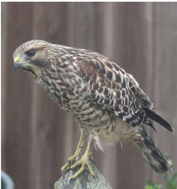
Top: Juvenile Cooper's Hawk; Bottom: Juvenile Red Shoulder Hawk