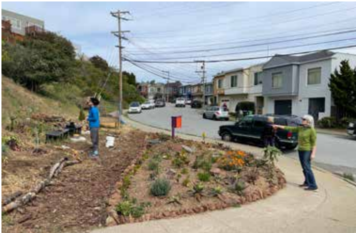
The Burlwood Drive and Bella Vista Way corner garden

house, and Orla said, "Didn't we walk by this street on that stairway walk?" Sure enough, this corner where the garden is today, is mentioned. What they say is, single sentence: "Could use a bit of community gardening." (Laughs) That was part of the inspiration.