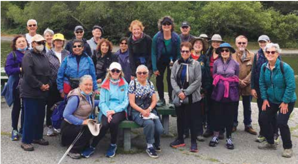
OLLI members' hike in June 2021.