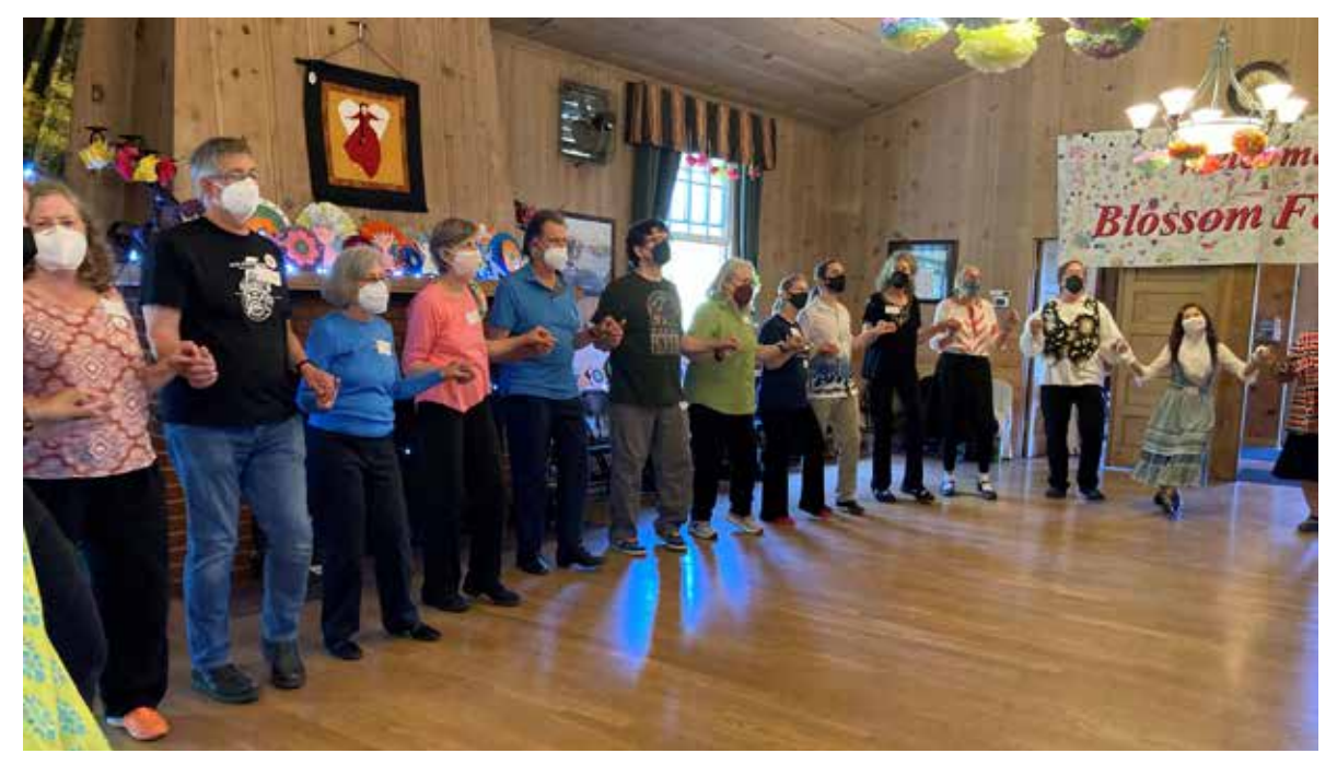
Changs International Folk Dancing at the MPIC celebrating the Blossom Festival