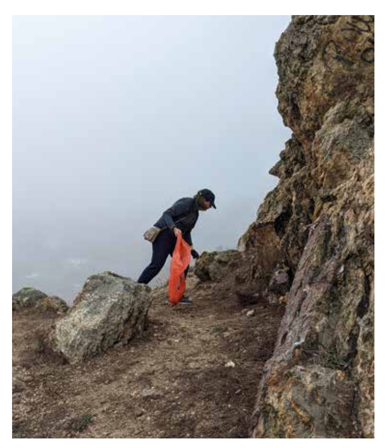
October 10 volunteer scouring the rocks for broken glass and trash.

The Marietta Drive clean-up has been an annual event, scheduled in the Fall after the foliage has died down. It resumed in 2022 after a two-year hiatus caused by the COVID-19 pandemic.