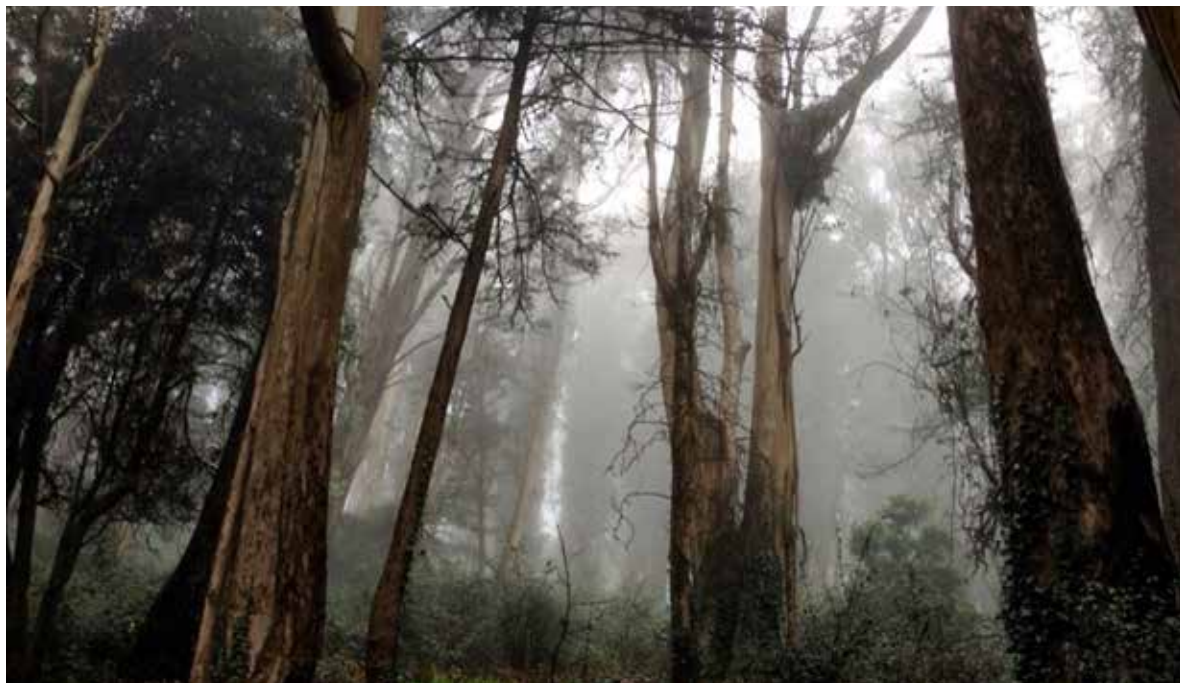
Mt. Davidson's Blue Gum Eucalyptus Trees in the Fog