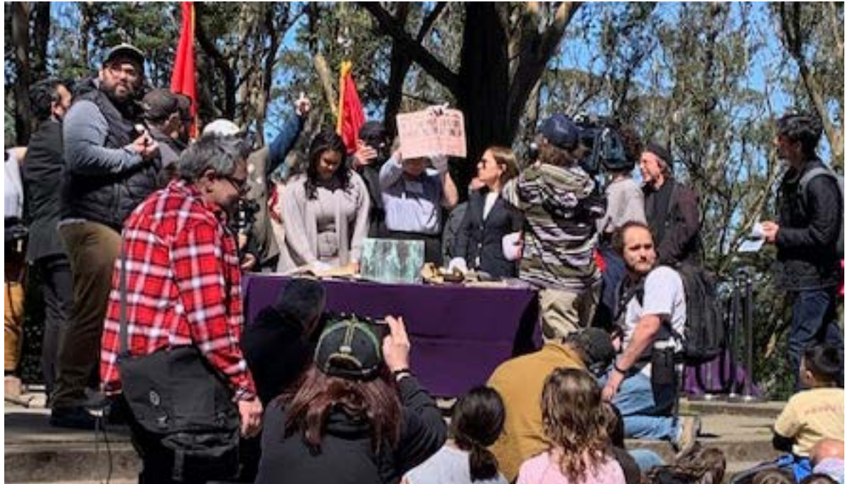
Mayor London Breed at the opening of the time capsule