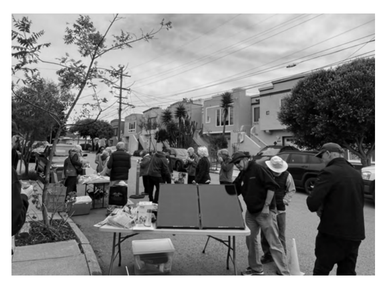
(below) Block Champion Ice Cream Social