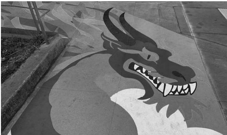
(above) The dragon of "Hop, Skip and Plan on Omar Way." The active play space was made possible by a 2018 PB grant.