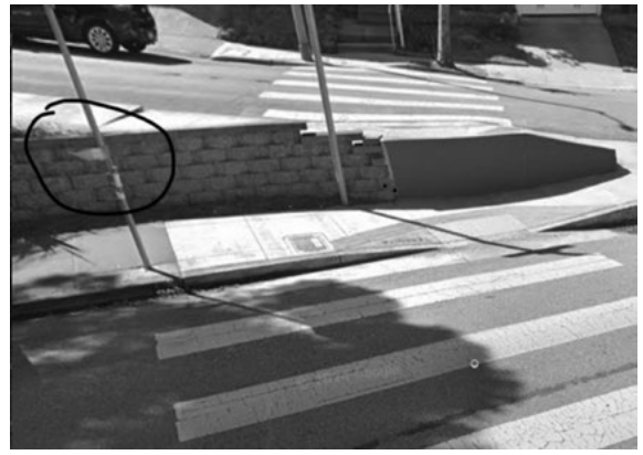
Pedestrian crossing flags at Teresita and Sequoia Way

Then in the fall of 2024, similar pedestrian crossing flags were installed at the very busy intersection of Teresita Blvd and Stillings Avenue. Not long after the City removed the crossing flags at both locations due to a complaint.