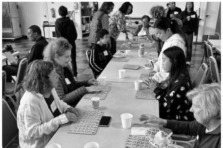
Lunch and bingo with prizes