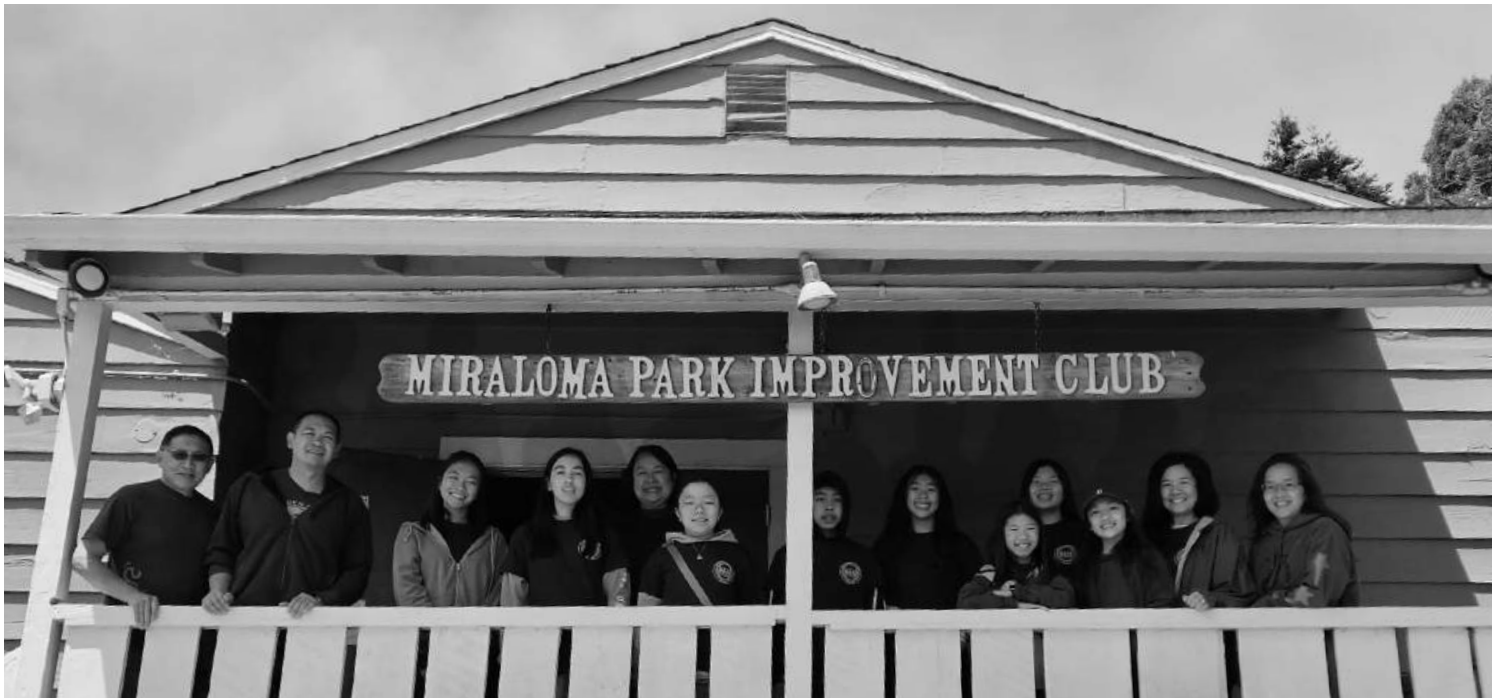
Cornerstone Church youths and adult chaperones

On July 1, 2025 the MPIC again welcomed the Cornerstone Church middle school summer youths and their adult chaperones to the clubhouse for their community service activity where they deep-cleaned our outside benches, trimmed the vegetation along the walkway, removed weeds in the parking lot and watered the native plants in our gardens. They also learned for the first time how to use the battery-powered leaf blowers.