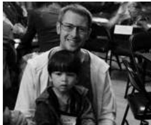
8 January 2026