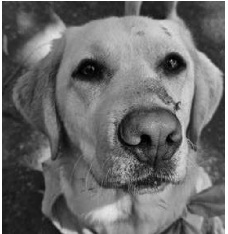
Zuri, 1 year old, yellow labrador

January in Miraloma is cold, foggy, rainy and full of wet paws. But our neighborhood pets are still out exploring. I was curious what they do all winter so I started with my dog Zuri: